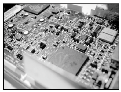
iPod up close

A quick search of the patent literature will reveal that Apple has a series of design patents for iPod designs. Common among the various design embodiments is the round Click Wheel consisting of concentric circles. They all have it- the 1G from 2001, the 2G from 2002, the 3G from 2003, the 4G from 2004, the Mini, the Shuffle, the Photo, the Nano, and the Video. It is the external shape and design of the iPod that serves as an important source of brand identity and product differentiation. The internal components of the iPod, interestingly enough, are not by Apple at all. They are components manufactured by Cypress Semiconductor, Sony, Texas Instruments, PortalPlayer, Samsung, Toshiba, Synaptics, and others. So is it the technology or a brilliant design that has made the iPod what it is today? A look